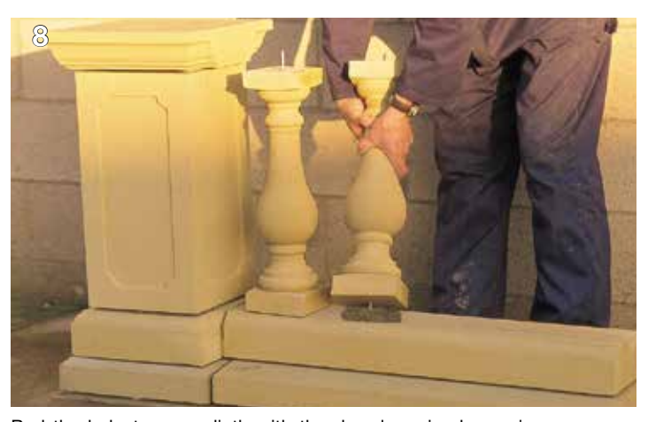
Bed the balusters on plinth with the dowels resined ensuring any seam marks run lengthways along the plinth.