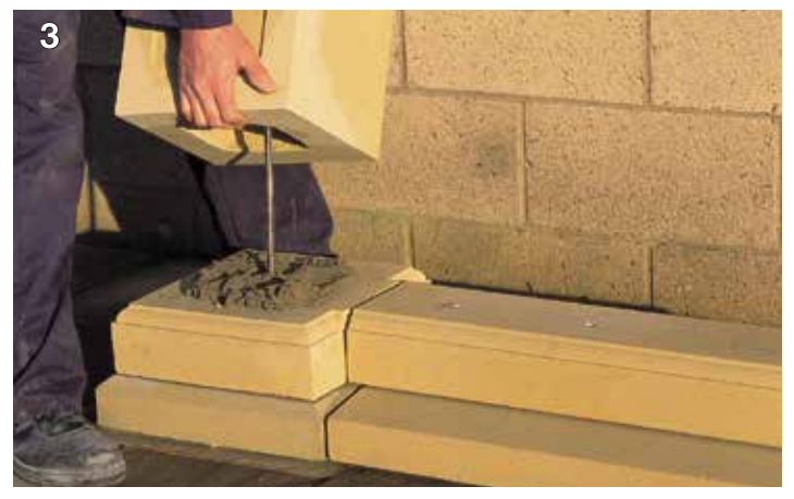
Resin fix a 10mm (%") stainless steel dowel positioned to extend 300mm (12") above the pier base. The pier shaft can then be bedded, using the method previously described.

Mark the pier base centrally and drill a 20mm (%") hole through the pier base and pier undercoping and into the foundation. Similarly, the undercoping and plinth should be drilled to a diameter of 10mm (%") and dowelled twice per stone into the foundation. Ensure that holes are positioned so that they will eventually be hidden by balusters.