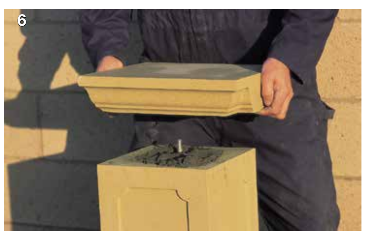
Drill a 20mm (%") hole in underside of pier cap and drill a 16mm (%") hole in the side of the pier cap at the rail run-in ready for the rail installation. Resin dowel and bed the pier cap on a continuous mortar bed on the pier shaft.