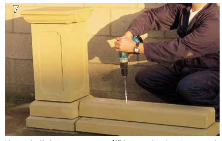
Mark and drill plinth to create 16mm (5%") holes to allow for tolerance ready for balusters at desired spacing in accordance with Tech Sheet B70