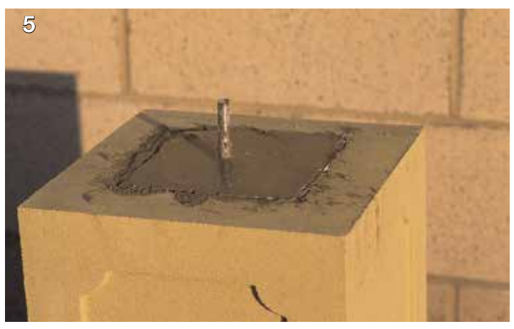
The isolating/expansion material is trimmed and the concrete trowelled so that both are flush with the top of the shaft. Insert 10mm (%") stainless steel dowel 100mm (4") long minimum into top of concrete, to protrude by 40mm (1½"). Only proceed once concrete has reached its initial set.