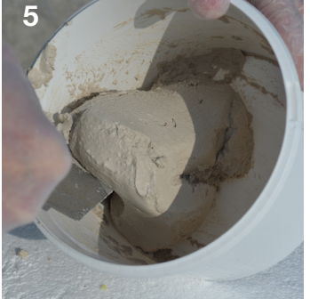
The TecStone pointing mix is ready to use when it has the consistency of putty. *See note below.