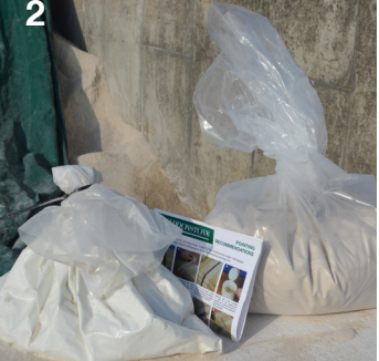
The TecStone pointing mix supplied as separately cement and aggregate with an information leaflet.