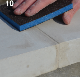
Any mix residue may be rubbed away with fine abrasive paper 2-3 days after completion.