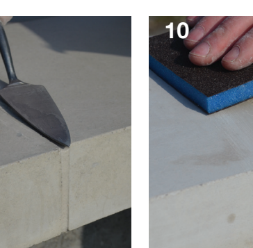
If necessary trowel over the joint once more to ensure a flush finish.