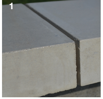
Before pointing ensure each 6mm (1/4") joint is free from loose particles. Avoid pointing in extreme conditions, particularly wet and cold.

Required: pointing mix, pointing trowel, masking tape (if required), mixing bowl, water, sponge. Please note: all text and photographs relate to TecStone pointing mix.