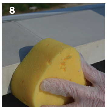
Wipe over the surface of the joint and surrounding area with a dampened sponge to remove all surplus pointing material off the surrounding areas and ensure a flush finish to the joint.