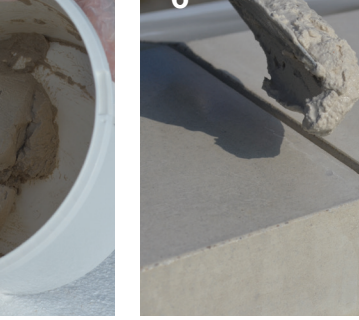
Scoop the mix into the joint, pressing with a trowel to ensure an even fill.