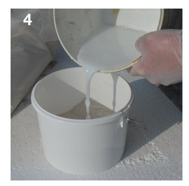
Carefully add small quantities of water to the TecStone pointing mix, mixing thoroughly to ensure the water is fully dispersed. *See note below.