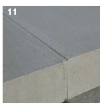
The finished joint.

* NOTE: It would be advantageous to use a waterproofing additive in the mixing water (SBR or other proprietary mortar admixture). The use of too much water can lead to the pointing mix colour and texture becoming unsightly, and the possibility of the mix bleeding into the adjacent cast stone.